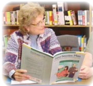
Lewis & Clark Literacy Council